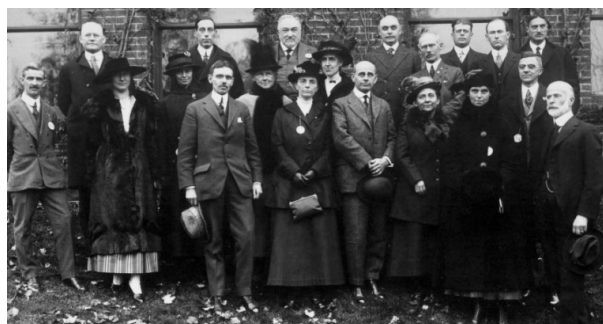
The AAVSO seventh annual meeting at Harvard College Observatory, 23 November 1918.