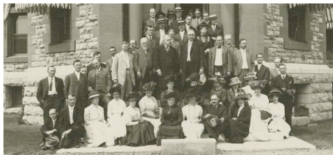
The Astronomical & Astrophysical Society of America, meeting in Ottawa, August 1911.

Science Foundation and the National Aeronautics and Space Administration in the United States, and various agencies in Europe and Asia, there has been a massive influx of government funds into national and international astronomy during the last sixty-five years. At the same time, traditional sources of support, such as the Carnegie Institution of Washington, have continued to find their own niches in the new world of patronage. This session will explore the impact of the new patterns of patronage on astronomy in the United States and elsewhere.