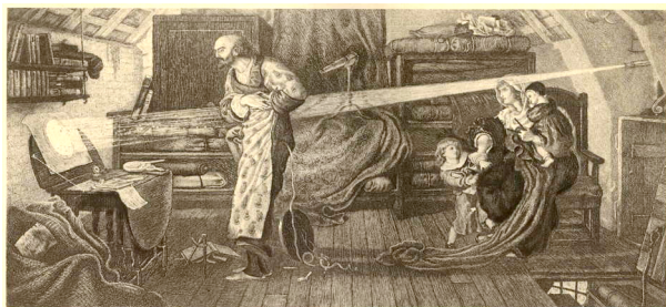
First observation of the transit of Venus by William Crabtree in 1639. From a 19th century mural by Ford Madox Brown.